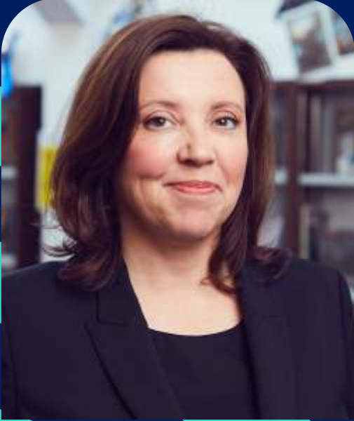
Dame Rachel de Souza, Chief Executive Officer